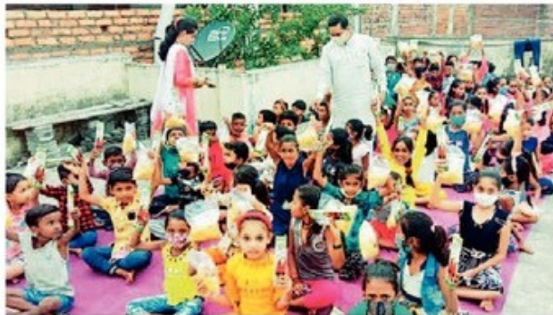
Volunteers distributing Diwali snacks, sparklers and stationery items in one of the Sewa Bastis in city.

"We started the Diwali snacks distribution programme last year. Owing to pandemic and the rough times that the city has witnessed, the people needed the affection and the positivity during the festival. We thought it would be fair to keep the tradition going and hence the joy of the festival of lights is being