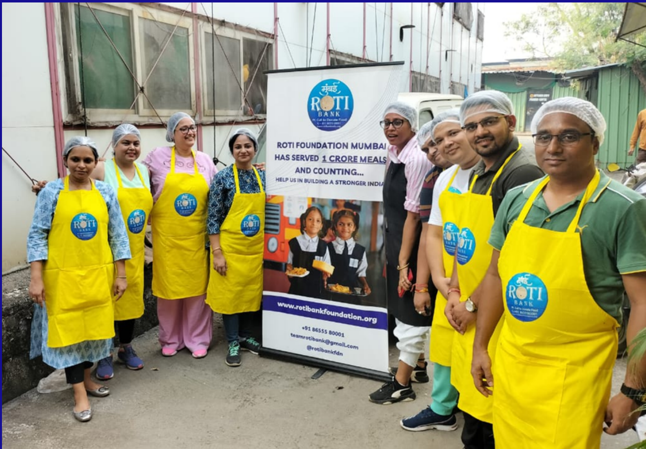
TEAM VODAFONE AT ROTI BANK KITCHEN FACILITY