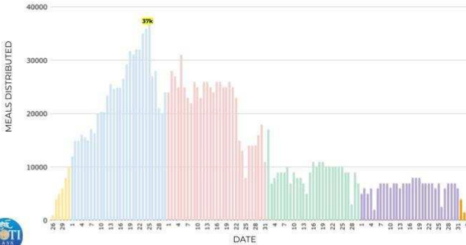
Mumbai Roti Bank

During COVID-19 we ramped up operations quickly to go from 2k to 37k meals per day in order to serve the needy