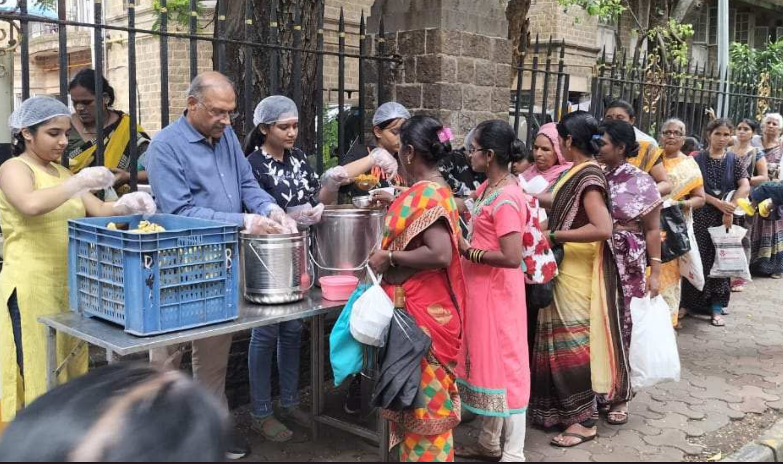
Teamwork in Action: PCGT Interns Extend a Helping Hand in Food Distribution