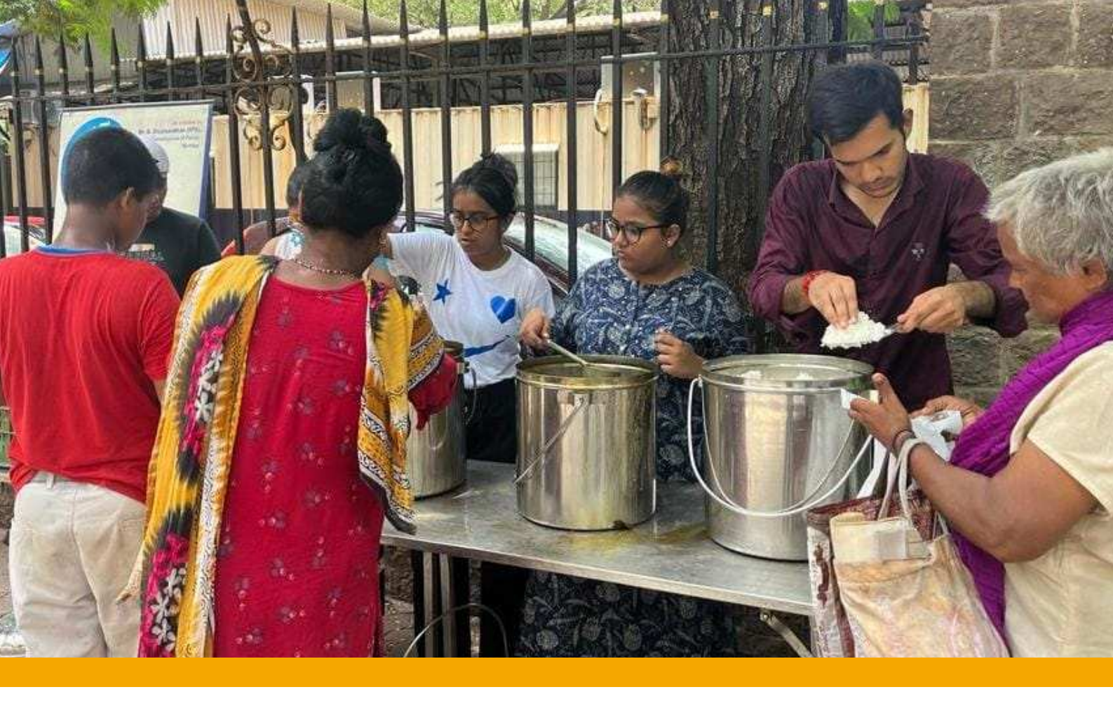
Teamwork in Action: PCGT Interns Extend a Helping Hand in Food Distribution