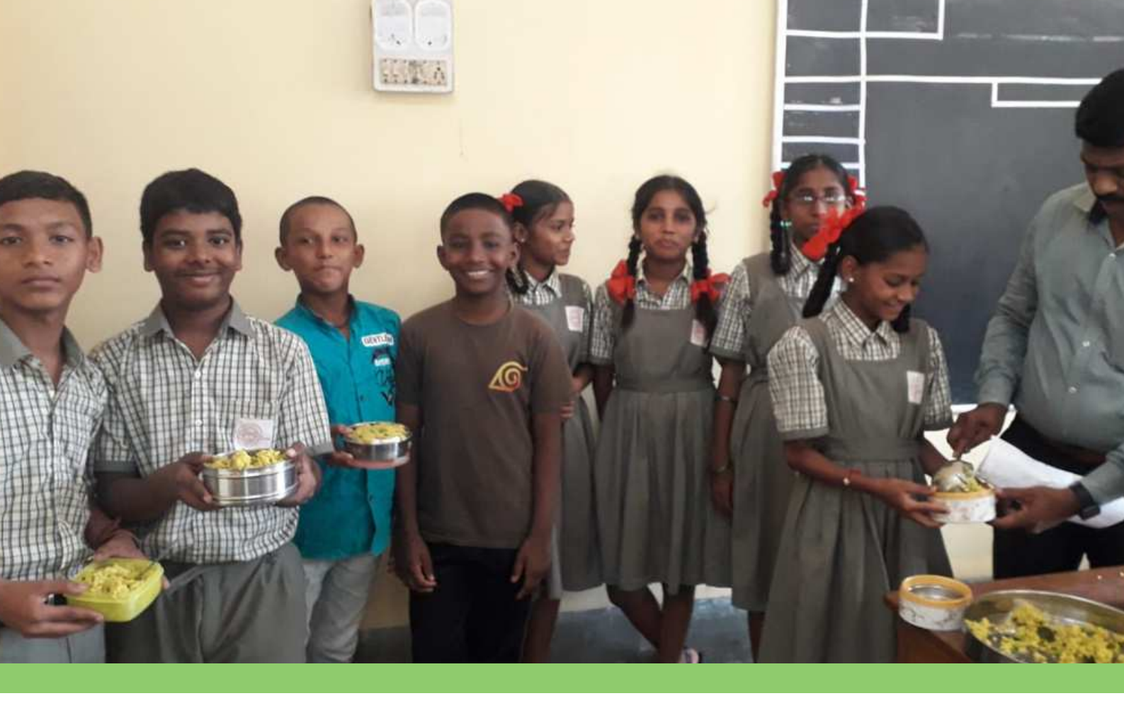
Celebrating the return of our students with scrumptious treats